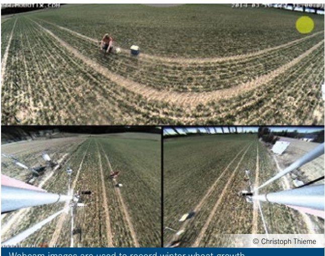
Webcam images are used to record winter wheat growth and critical climatic events

Research Unit 1695 "Agricultural Landscapes under Global Climate Change – Processes and Feedbacks on a Regional Scale". To verify the results of his model, Heinlein measures water transport in maize plants both at the Scheyern agricultural research farm and with the help of Helmholtz Centre lysimeters. Using terrestrial laser scans, Heinlein also determines the structure of the maize plants, which he then compares to the modeled plant architectures created with the help of the Lindenmayer System – a model used for the geometric representation of plant organ development.