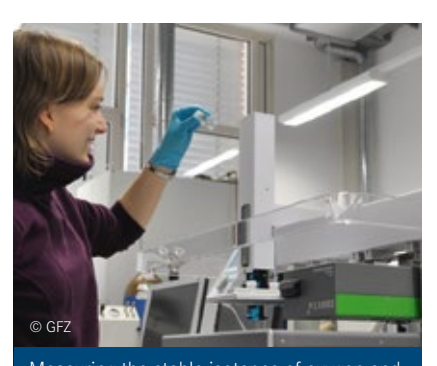
Measuring the stable isotopes of oxygen and hydrogen with the help of a cavity ring-down spectrometer

TERENO'S "Water Isotopes" working group hosts workshop