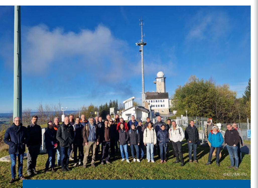
In fine autumn weather, the workshop was rounded off with an excursion to the German Weather Service's Hohenpeissenberg observatory and the neighbouring TERENO site at Fendt.

About 70 experts met in Garmisch-Partenkirchen from 8 to 11 November 2022 for the 12th TERENO Workshop. The event, organised by Karlsruhe Institute of Technology's Institute for Meteorology and Climate Research (IMK-IFU), was held under the motto "From Observation to Modelling".