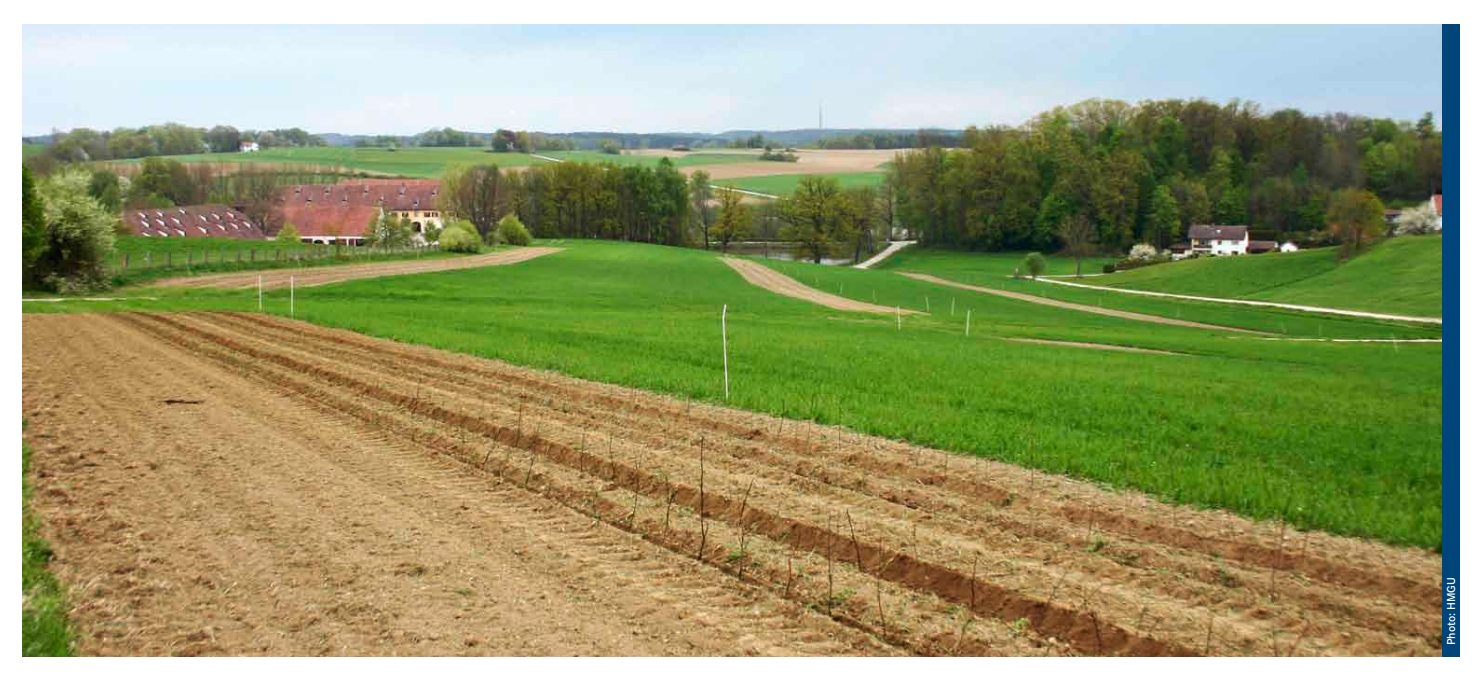
Soil is an important source of atmospheric carbon dioxide ( CO_2 ), which is released when plant residues are broken down. This process is dependent on various factors, including soil temperature and water content. Amongst other things, TERENO conducts long-term observations of element fluxes in the soil, for example at the Scheyern research station