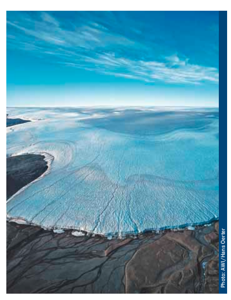
Sea levels are rising as glaciers and ice sheets in polar regions melt at an increasing rate (photo depicts a glacier in Greenland). REKLIM examines regional consequences, for example, investigating possible effects on Germany's coastal region consequences at a regional level, for example Germany's coastal region

REKLIM's research activities are currently divided into seven topics, with three additional topics in the pipeline. There is a particularly strong tie-in with TERENO in Topic 4: Land surfaces in the climate system. This topic focuses on the complex chain of cause and effect at the intersection of atmosphere and land surface, where numerous physical, chemical and biological processes occur. The aim is to understand how these processes are interlinked. That is the key to better predictions on the regional effects of climate change and their potential consequences. To this end, scientists require environmental data which have been collected over a longer period