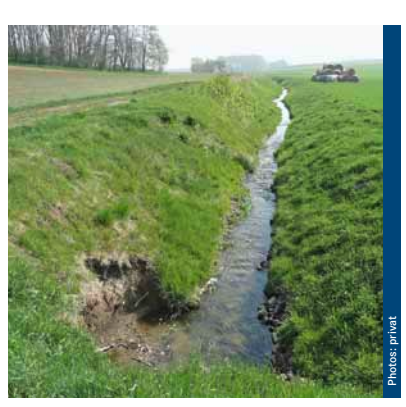
Dr. Mikhail Beketov (left) conducts research within the catchment area of the river Bode. The river branches into small agricultural streams (right) that are frequently contaminated by pesticides from the surrounding fields. The measurement devices which Dr. Beketov has installed in the river Bode collect samples at high tide. Pesticides are particularly liable to seep into the river from the fields after it has rained

food or oxygen. In addition, the effects of intoxication are necessarily very different depending on whether the organism in question is an insect with a short life-span or a relatively long-lived frog. The SPEAR pesticide indicator takes these factors into consideration and uses them to provide concrete assessments of environmental risks for a given location.