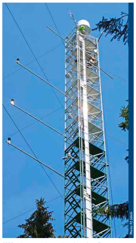
ICOS unites measuring stations throughout Europe in a common network, including the research tower at the Wüstebach test site, part of the TERENO observatory "Eifel-Lower Rhine Basin"

In addition to measuring stations on land, research equipment will also be loaded up on to ships in order to capture data at sea. Up to now, the sea has been considered a massive carbon dioxide sink, and as such, a great hope for climate protection. However, new data suggest that the oceans' capacity for absorbing climate-damaging carbon dioxide is in rapid decline.