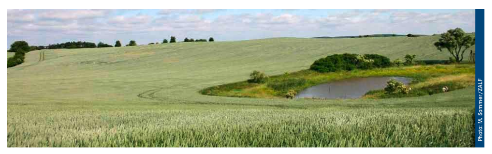
The numerous bogs located in the North German Lowlands are substantial {\rm CO_2} sources. ZALF-researchers are investigating the viability of flooding bogs to put a lid on emissions